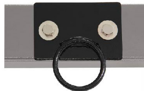
✓ FCO2-3 ✓