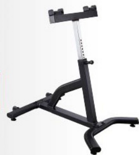
/// FDB1-2 ///