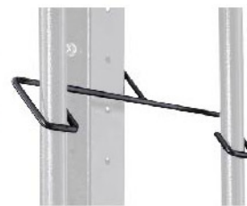
/// FDB1-3 ///