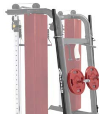
CL DCC-2 Dual Renegade